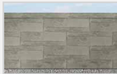
BLOCKS & CAP MIX