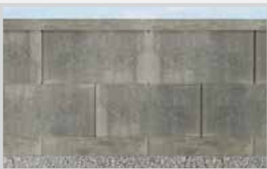
BLOCKS ON END