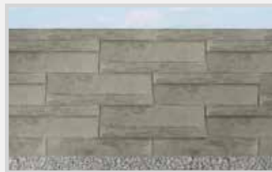
BLOCKS & CAP MIX - OFFSET