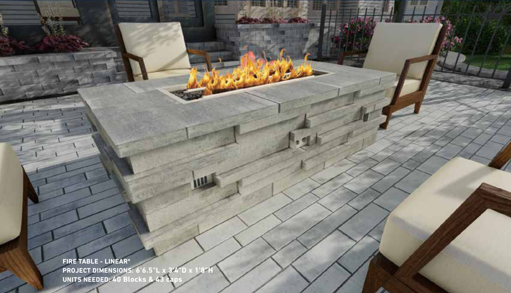
FIRE TABLE - LINEAR* PROJECT DIMENSIONS: 6'6.5"L x 3'4"D x 1'8"H UNITS NEEDED: 40 Blocks & 43 caps