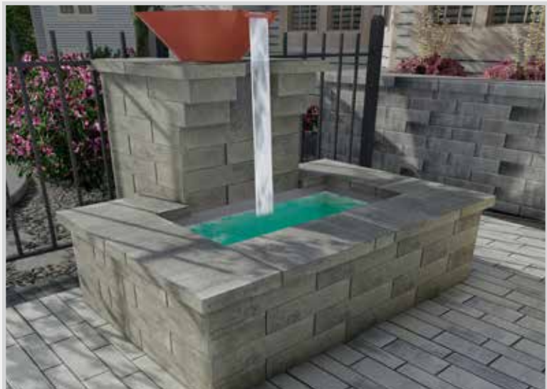
WATER FEATURE - BOWL