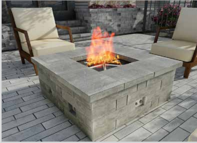
FIRE PIT - SQUARE