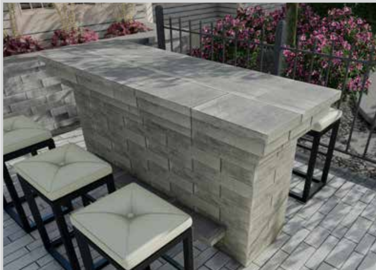
BAR ISLAND - LEDGE