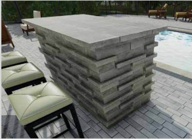
BAR ISLAND - CAPS MIX