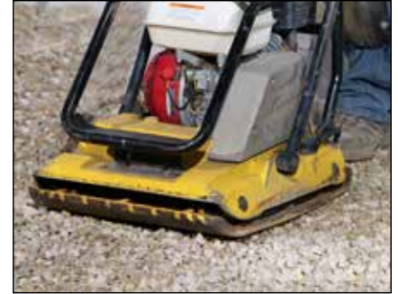
Diagram 1—Base Preparation

To end a freestanding wall, every other course will require a unit to be cut to length. Ensure that all cut ends are placed within the wall to maintain a clean aesthetic.