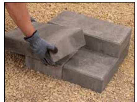
Diagram 4—Constructing Columns