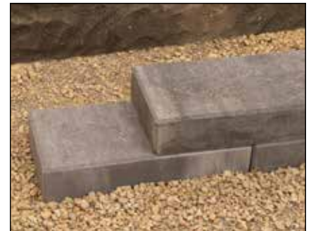
Diagram 2—Wall Course