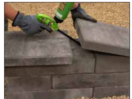
Diagram 3—Capping the Wall